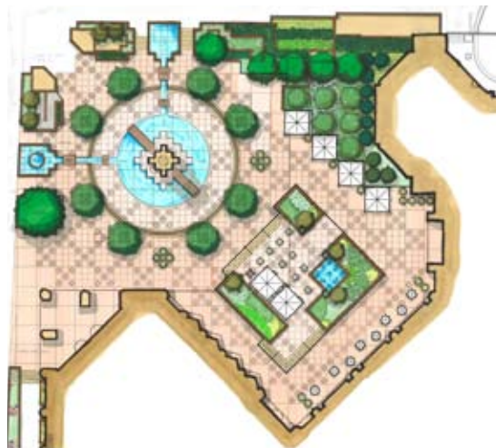
Plaza Renovations rendering

Color renderings of the project will be displayed on the Plaza Level of One Wachovia Center so people can see the planned changes. Tenants and occupants will also be able to follow the project’s progress in future editions of Skylights.